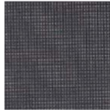
BACKREST IN BLACK MESH ONLY