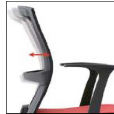
SPRING HEAD TILTING