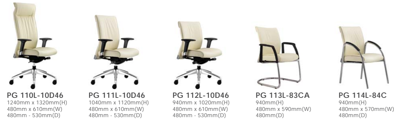
PG 110L-10D46 1240mm x 1320mm(H) 480mm x 610mm(W) 480mm - 530mm(D) PG 111L-10D46 1040mm x 1120mm(H) 480mm x 610mm(W) 480mm - 530mm(D) PG 112L-10D46 940mm x 1020mm(H) 480mm x 610mm(W) 480mm - 530mm(D) PG 113L-83CA 940mm(H) 480mm x 590mm(W) 480mm(D) PG 114L-84C 940mm(H) 480mm x 570mm(W) 480mm(D)

Product: PEGASO | Material: Leather / Polyurethane